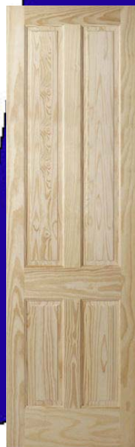
8 0 Pine 4 Panel