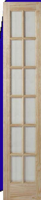
8 0 12 Lite