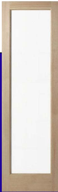
8 0 1 Lite