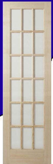
8 0 18 Lite