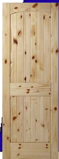
6 8 Sedona Knotty Pine