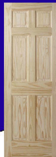
6 8 Pine 6 Panel