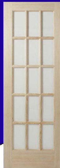
6 8 15 Lite