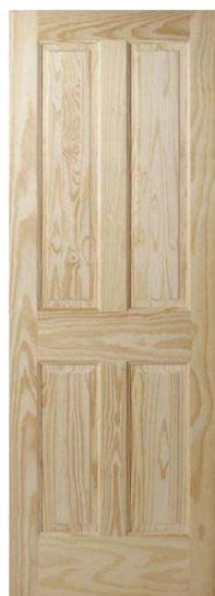
6 8 Pine 4 Panel