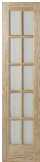
6 8 10 Lite