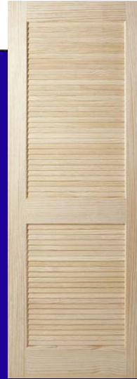
6 8 Louver