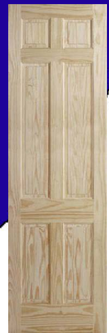
8 0 Pine 6 Panel