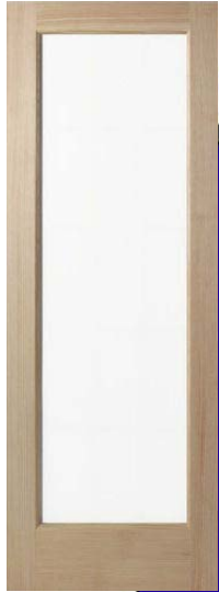
6 8 1 Lite