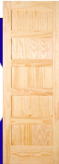
6 8 Pine 5 Panel Shaker