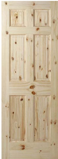
6 8 Knotty Pine 6 Panel