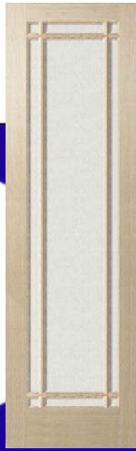
8 0 Prairie