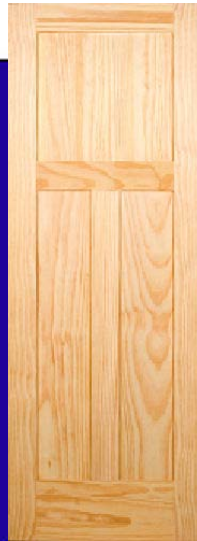
6 8 Pine 3 Panel Shaker