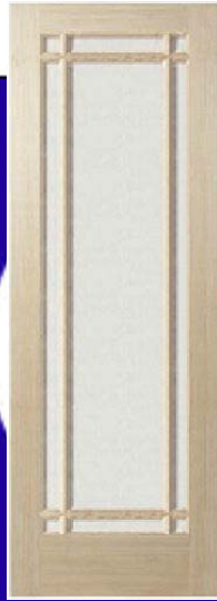
6 8 Prairie