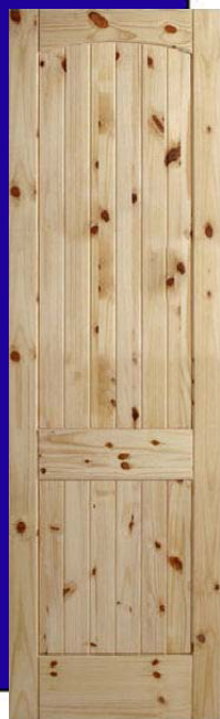
8 0 Sedona Knotty Pine